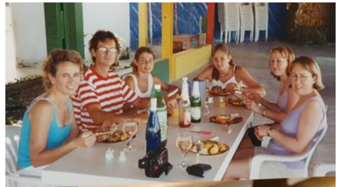
From Left: My mum, dad, me, and my sister in 2000.

smiles on their faces. Their lives had hope again – that is the impact that the project had on them. With that hope came a better future, not just for the children at the project, but for their families and the wider community. I remember that their faith in God was nurtured and encouraged (and still is), and it was an amazing experience to grow my faith in God alongside the other children. The University of Life is where I first heard God's voice. It is a haven of love and hope. The children's faces are imprinted in my mind – God never lets me forget them.