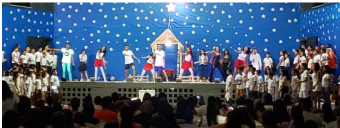
Christmas Musical - Parents and Students, 2019

These pictures remind us what Christmas should look like at The University of Life! Like you, we hope and pray that we will all find ways to celebrate Christmas this year, valuing those we love and looking forward to new opportunities in 2021. HAPPY CHRISTMAS!