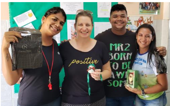
Christmas Staff Fun with Brazilian Olaf, 2019