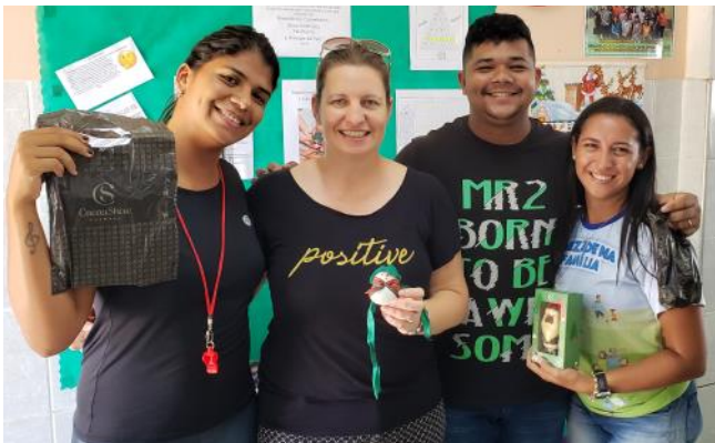
Christmas Staff Fun with Brazilian Olaf, 2019