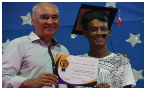
Year 9, 2019