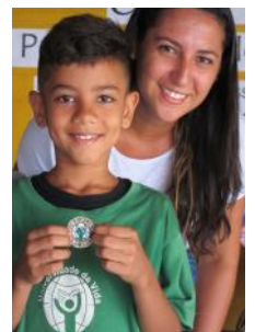
Year 3, 2017