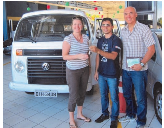
Picking up the keys at the VW Dealer, 26th October

We are appealing for help to make up these boxes in the form of a special Christmas donation. Each box will cost approximately £5.