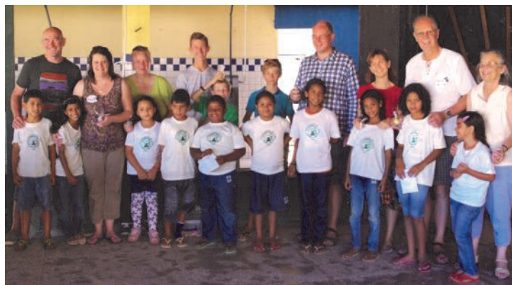
Visiting Team With University of Life Students